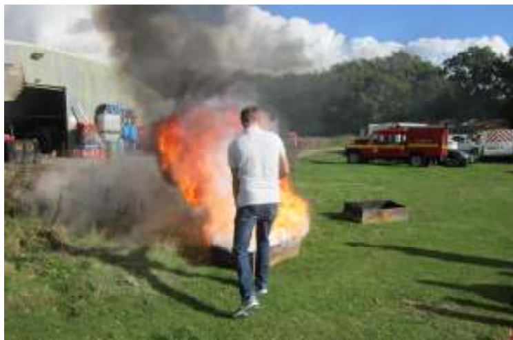
MultiChem on a Class B fire

CheckFire brought MultiChem and EniroFoam extinguishers which the former was used on a deep fat fire and a petroleum tray fire, the EnviroFoam was used on a petroleum tray fire, both to great effect.