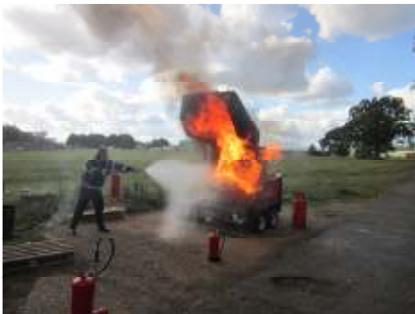
Water Mist on a Class F fire

Jewel Group brought Water Mist extinguishers which were used on a deep fat fire and petroleum tray fire to great effect. Their Class D fire extinguisher was demonstrated on a flammable metal fire;