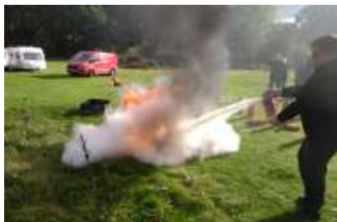
Dry Powder on a Class B fire

Peter Edwards our host provided Dry Powder and CO 2 extinguishers that members used to successfully extinguish petroleum tray fires;