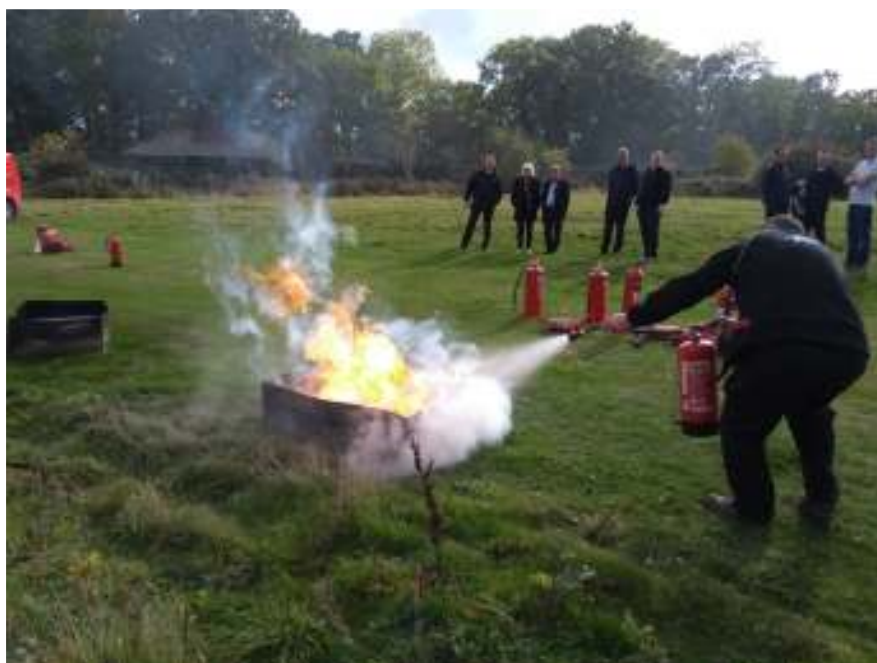
EnviroFoam on a Class B fire