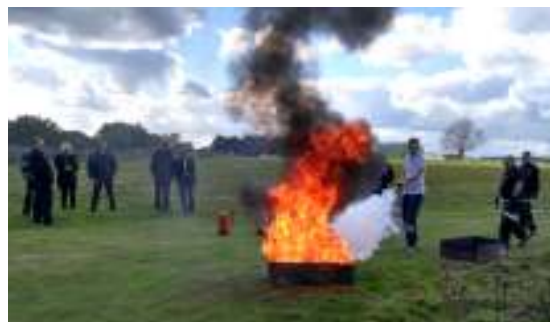
CO 2 on a Class B fire