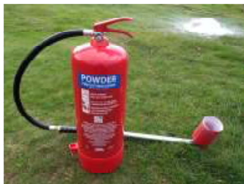
Class D Powder on a metal fire

The highlight for me though was seeing a Metal Fire Powder extinguisher being used on a vigorously burning flammable metal fire.