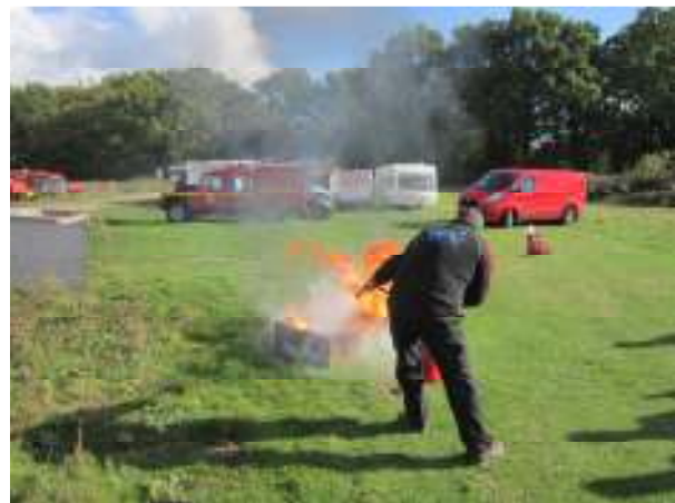
Water Mist on a Class B fire

The highlight for me though was seeing a Metal Fire Powder extinguisher being used on a vigorously burning flammable metal fire.