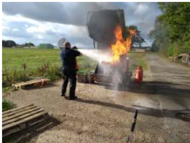
MultiChem on a Class F fire